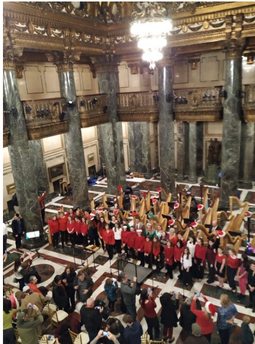
Holiday Harp Ensemble Concert--December 10, 2019 Carnegie Music Hall Grand Lobby, 29 harpists performing